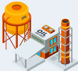
Oil and Gas Extraction