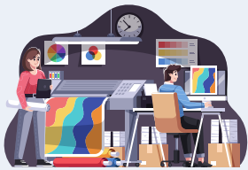
Printing and Related Support Activities