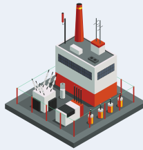
Power Generation Transmission and Distribution