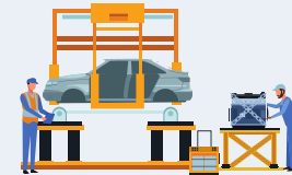
Motor Vehicle Parts Manufacturing