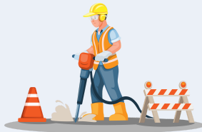
Highway, Street and Bridge Construction