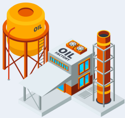
Oil and Gas, Mining, Support Activities