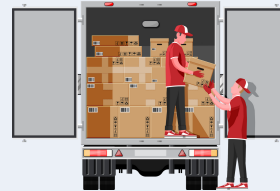
General and Specialized Freight Trucking