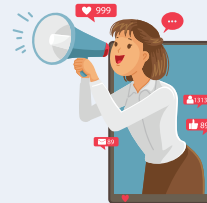
Advertising, Public Relations and Related Services