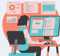
Computer System Design and Related Services