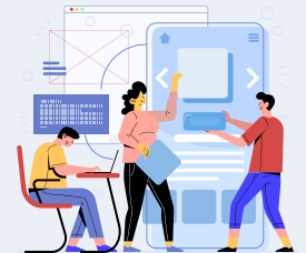
Specialized Design Services